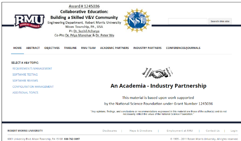
Figure 2. Active learning tools in project website

The active learning tools are available through the project website www.rmu.edu/nsfvv (depicted in Figure 2) and ENSEMBLE, a Computing Portal connecting Computing Educators, accessible through www.computingportal.org (depicted in Figure 3). The tools and supporting documents are organized based upon SV&V topics. Folders are provided for activities related to Configuration Management, Requirements Management, Software Reviews, and Software Testing. Underneath each of these folders are folders for the active learning tools: Case Studies, Class Exercises, Case Study Videos, and Topical Assessments. For greater availability, the videos have been uploaded to YouTube.